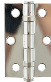
Product Finish Pictured: Polished Chrome